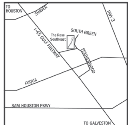
The Rose Southeast